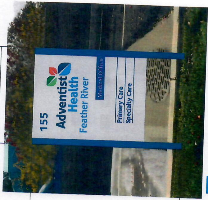
A PROPOSED SIGN SCALE: 1" = 1'-0"