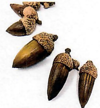
Valley Oak Acorn