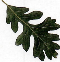
Valley Oak Leaf