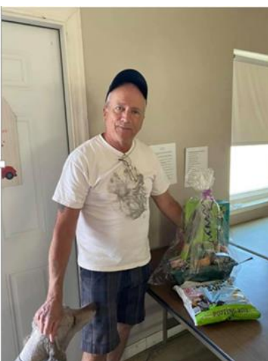
June prize winner