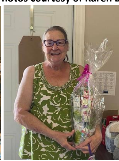
May prize winner